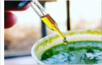
7X More Powerful Than Medical Marijuana