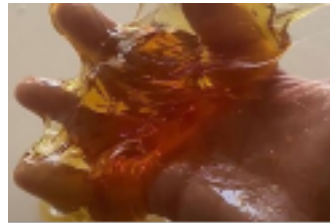
Heart Surgeon Begg Americans: "Stop Putting This in Your Coffee"