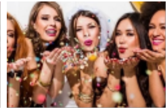
Pro Tips For Clear Skin Before Your Next Big Event