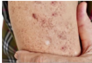
4 Signs Of Dying Liver (Write These Down)