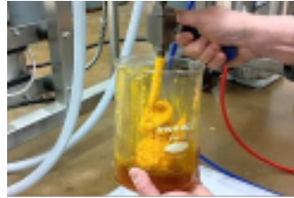
CBD Gummies For Sleep, Pain and Stress Now Legal in the US