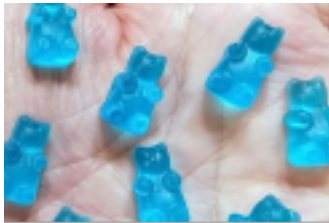
Fix ED Now With Just 1 Gummy