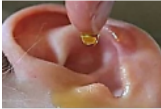
Simple Method "Ends" Tinnitus - Stops Ringing Ears (Watch)