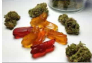
Here's What You Should Know Before You Take CBD