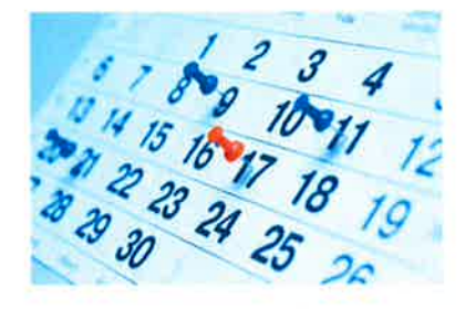
Just a reminder you may attend a Board and Committee Meeting via teleconferencing by clicking here.