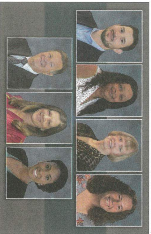
Members of the Citizens Oversight Committee.