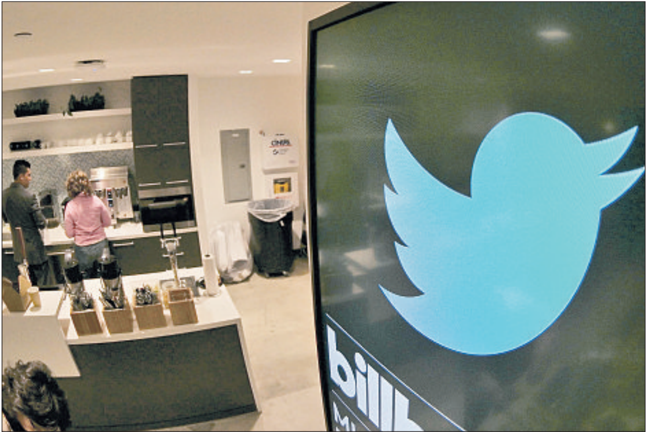
THE KITCHEN at Twitter's office in Santa Monica. Attempts to introduce people to a wide range of opposing political views on social media sites might be not only ineffective but counterproductive, researchers reported.