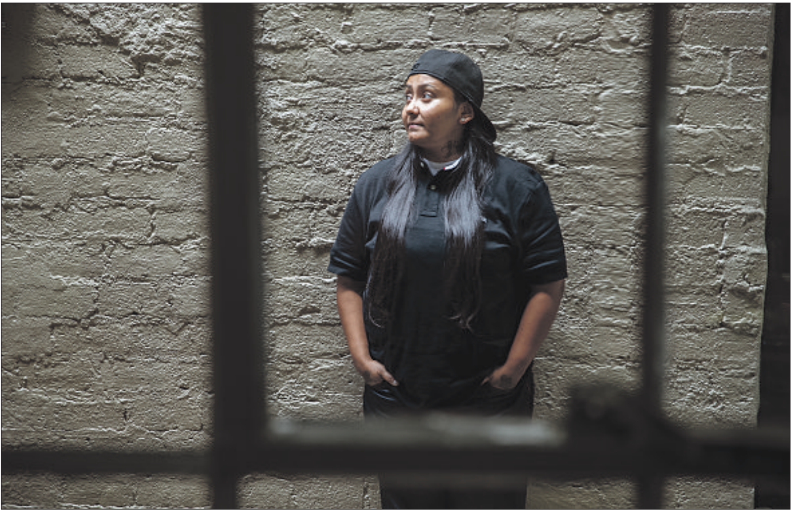
ALLEN J. SCHABEN Los Angeles Times

The settlement applies to more than 93,000 women incarcerated between March 2008 and January 2015. The most intrusive search conditions were in place before July 2011, and the least intrusive conditions occurred after February 2014, when officials enclosed the bus bay and kept it heated. They began using a scanner later