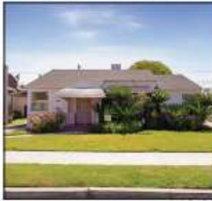
The Tom and Ethel Bradley residence has been nominated as a Los Angeles city landmark.

For information about the project, visit getty.org/african-american-historic-places .