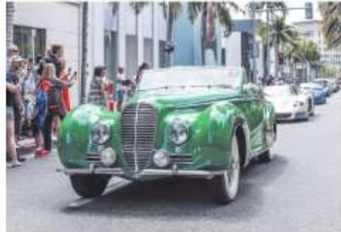
1947 Delahaye 135 MS V8 Roadster by Chapron