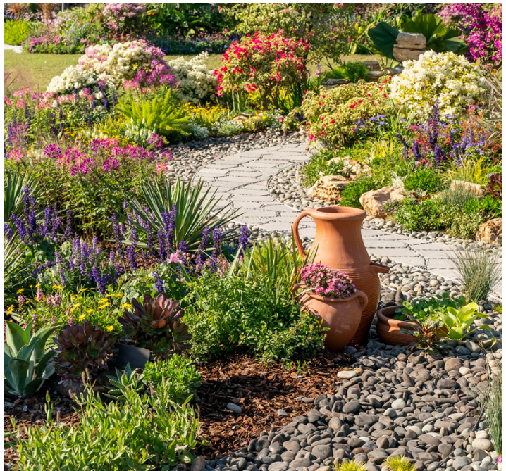
A drought-tolerant garden.

After years of severe drought, California's water supply has improved for many parts of the state. GSWC customers did a tremendous job reducing water use during the last drought, and most have continued those water-efficient practices and made conservation a way of life. GSWC is proud to be your partner in conservation, offering tips and programs to help you manage your water use and control your bill. To learn more about conservation programs and rebates in your area, please visit www.gswater.com/conservation or call 1.800.999.4033.