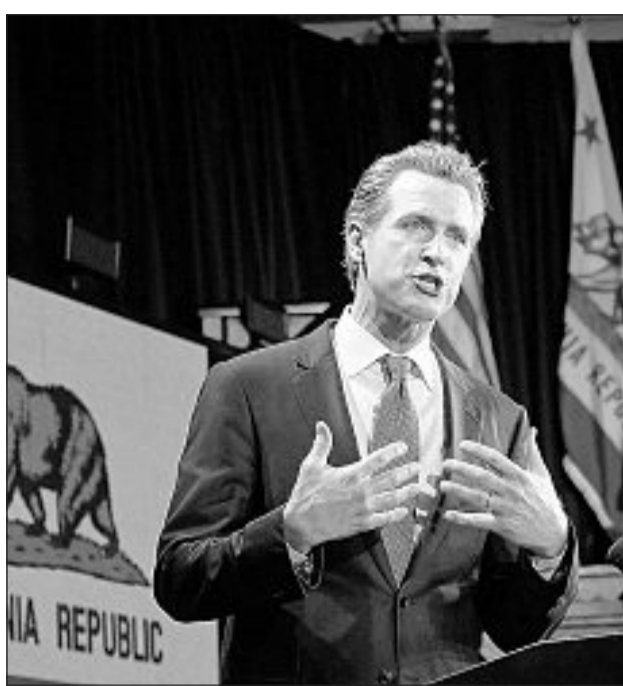
GOV. GAVIN NEWSOM said the city of Emeryville did not need an exemption from state tax limits.

Emeryville, in Alameda County, has also asked for permission to pursue a tax increase above the existing cap for local levies, a bill that's pending at the state Capitol.