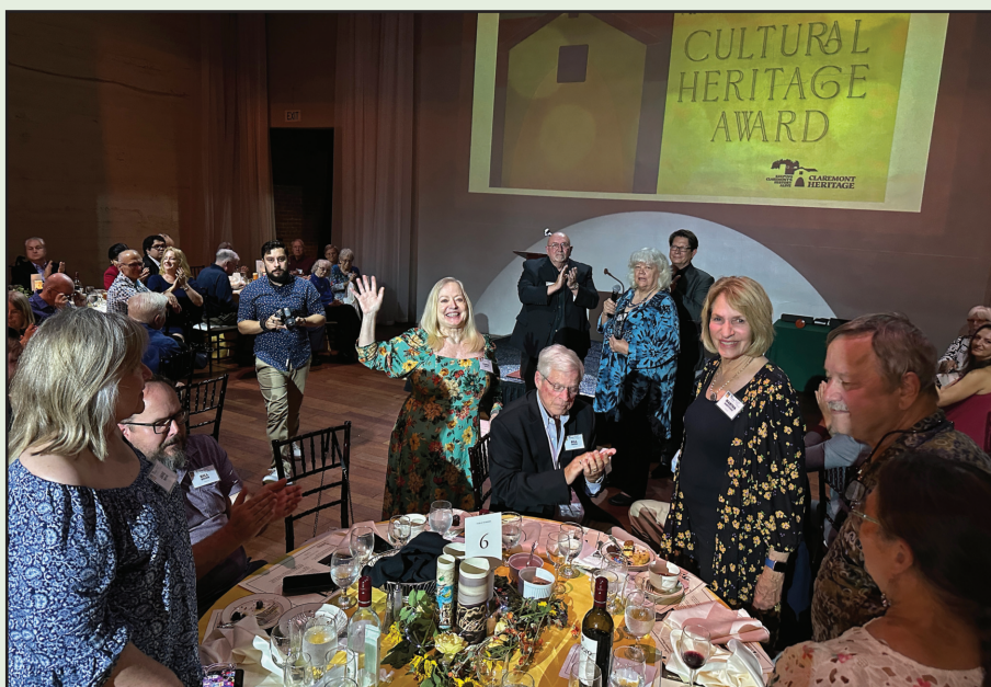
Supporters and board members from Scripps Fine Arts Foundation were all smiles after winning Claremont Heritage's Cultural Heritage award during the annual dinner presentation Sunday evening at Padua Hills Theatre.