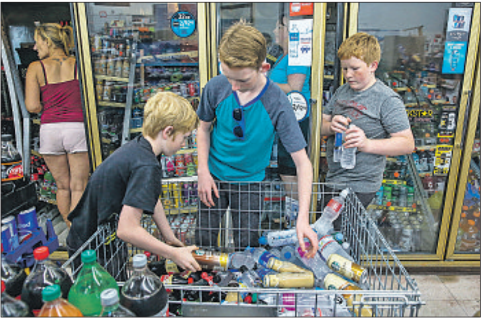
IRFAN KHAN Los Angeles Times

Then the 7.1 quake struck, reclassifying the earlier temblor as a foreshock. The phenomenon — and