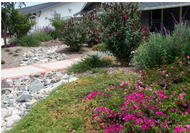
A drought-tolerant garden.