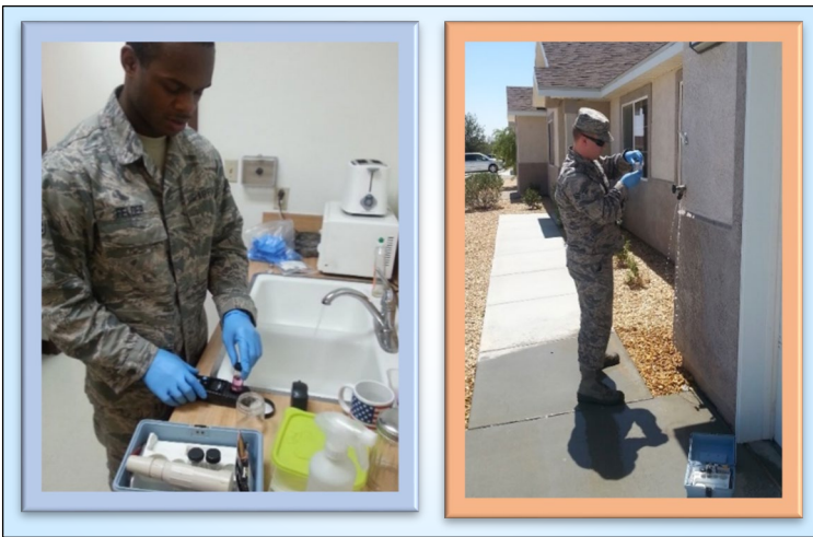
Pictured above: Technicians from the 412th Operational Medical Readiness Squadron, Bioenvironmental Engineering Flight conducting routine water testing at locations spanning the water distribution system. Water samples are collected, tested by a certified laboratory, and results are submitted to the State Water Resources Control Board to demonstrate compliance with all requirements and regulations.