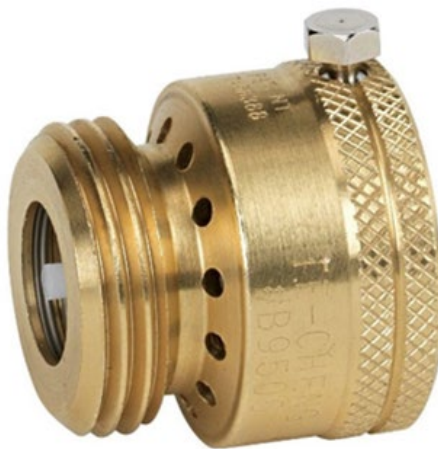
Hose Bib Vacuum Breaker