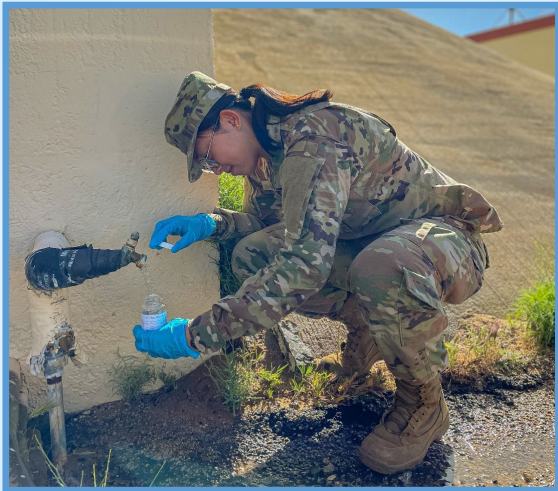
Pictured above: A technician from the 412th Operational Medical Readiness Squadron, Bioenvironmental Engineering Flight conducting routine water testing at locations spanning the water distribution system. Water samples are collected, tested by a certified laboratory, and results are submitted to the State Water Resources Control Board to demonstrate compliance with all requirements and regulations.