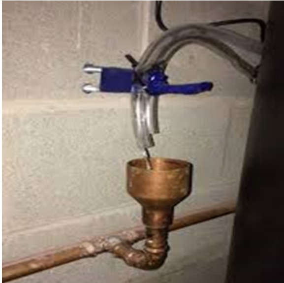
Air Gap Example 1