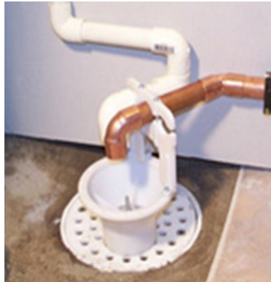
Air Gap Example 2