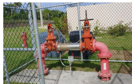
Example of a double check backflow prevention assembly

Disclaimer: To the extent this document mentions or discusses statutory or regulatory authority, it does so for information purposes only. It does not substitute for those statutes or regulations, and readers should consult the statutes or regulations themselves to learn what they require. The mention of trade names for commercial products does not represent or imply the approval of EPA.