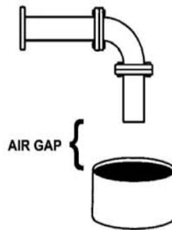
Figure 1. Air Gap Separation