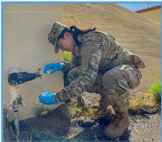
Pictured above: A technician from the 412th Operational Medical Readiness Squadron, Bioenvironmental Engineering Flight, conducting routine water testing at locations spanning the water distribution system. Water samples are collected, tested by a certified laboratory, and results are submitted to the State Water Resources Control Board to demonstrate compliance with all requirements and regulations.

Our water is treated with chlorine, which is a disinfectant that kills dangerous bacteria and other microorganisms that may be in the water. The 412th Civil Engineering Squadron monitors the disinfectant levels on a daily basis.