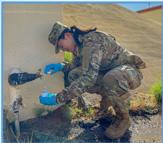
Pictured above: A technician from the 412th Operational Medical Readiness Squadron, Bioenvironmental Engineering Flight, conducting routine water testing at locations spanning the water distribution system. Water samples are collected, tested by a certified laboratory, and results are submitted to the State Water Resources Control Board to demonstrate compliance with all requirements and regulations.

Our water is treated with chlorine, which is a disinfectant that kills dangerous bacteria and other microorganisms that may be in the water. The 412th Civil Engineering Squadron monitors the disinfectant levels on a daily basis.