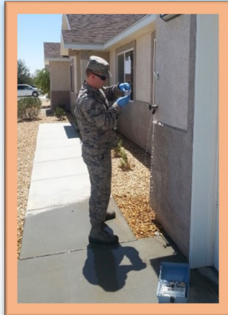
Pictured above: Technicians from the 412th Operational Medical Readiness Squadron, Bioenvironmental Engineering Flight conducting routine water testing at locations spanning the water distribution system. Water samples are collected, tested by a certified laboratory, and results are submitted to the State Water Resources Control Board to demonstrate compliance with all requirements and regulations.