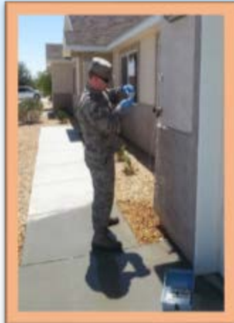
Pictured above: Technicians from the 412th Operational Medical Readiness Squadron, Bioenvironmental Engineering Flight conducting routine water testing at locations spanning the water distribution system. Water samples are collected, tested by a certified laboratory, and results are submitted to the State Water Resources Control Board to demonstrate compliance with all requirements and regulations.