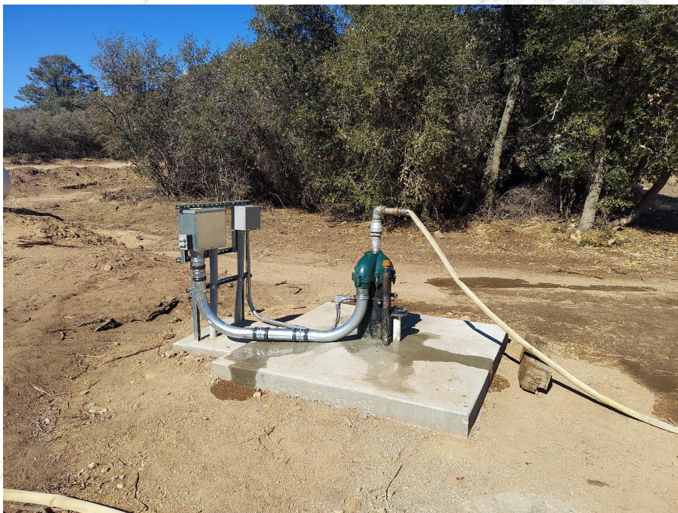
Montclair West Well