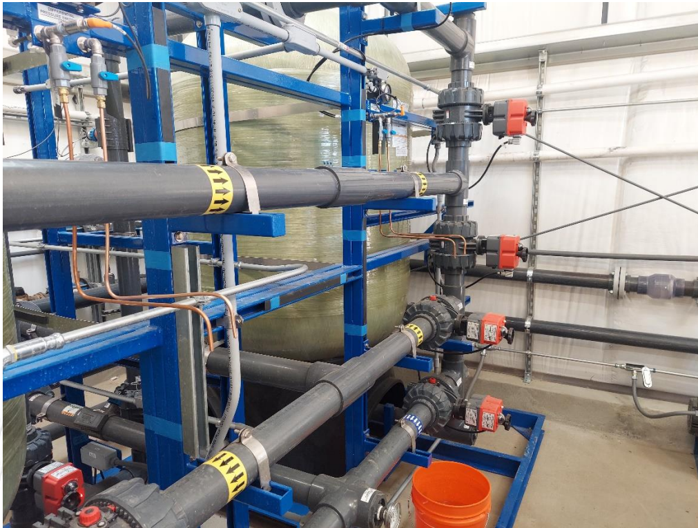
Iron and Manganese Filtration