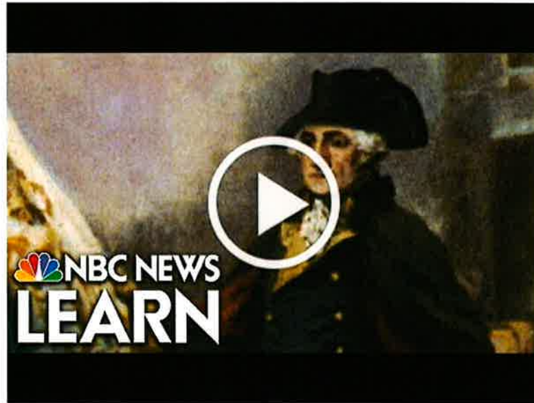
George Washington and the Continental Army