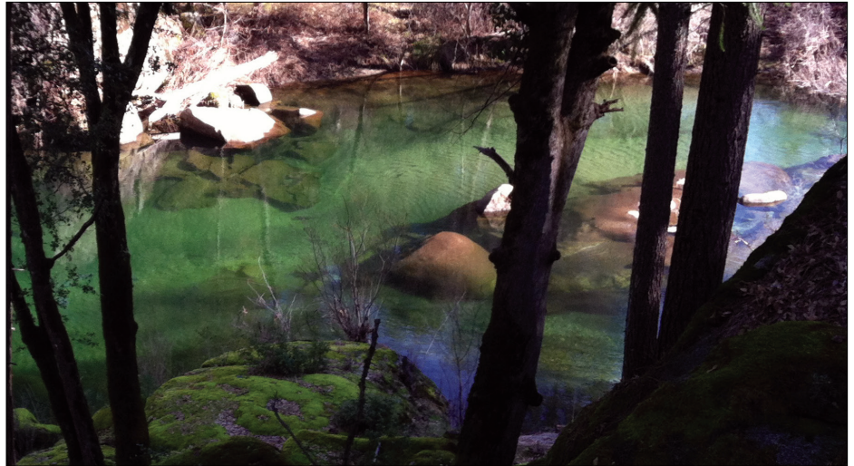
Water for the Outingdale service area is diverted from the Middle Fork Cosumnes River

The El Dorado Irrigation District Board of Directors meetings are open to the public and are held on the second and fourth Mondays of each month. Meetings begin at 9:00 A.M. in the Placerville headquarters building at 2890 Mosquito Road. Go to the District website at www.eid.org to learn more.