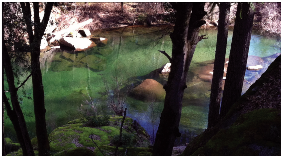
Water for the Outingdale service area is diverted from the Middle Fork Cosumnes River

The El Dorado Irrigation District Board of Directors meetings are open to the public and are held on the second and fourth Mondays of each month. Meetings begin at 9:00 A.M. in the Placerville headquarters building at 2890 Mosquito Road. Go to the District website at www.eid.org to learn more.