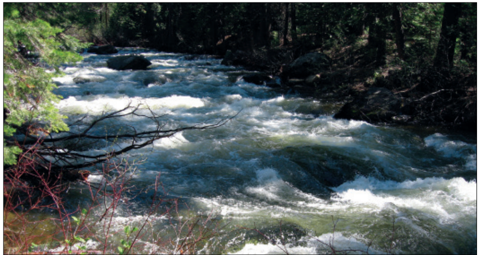
Water for the Strawberry service area is diverted from the upper South Fork American River

The El Dorado Irrigation District Board of Directors meetings are open to the public and are held on the second and fourth Mondays of each month. Meetings begin at 9:00 A.M. in the Placerville headquarters building at 2890 Mosquito Road. Go to the District website at www.eid.org to learn more.