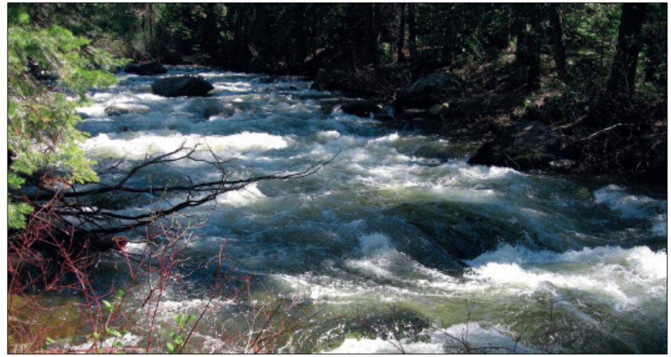
Water for the Strawberry service area is diverted from the upper South Fork American River

The information provided in this report is required by law to be issued to every water user. Property owners: please share this information with your tenants.