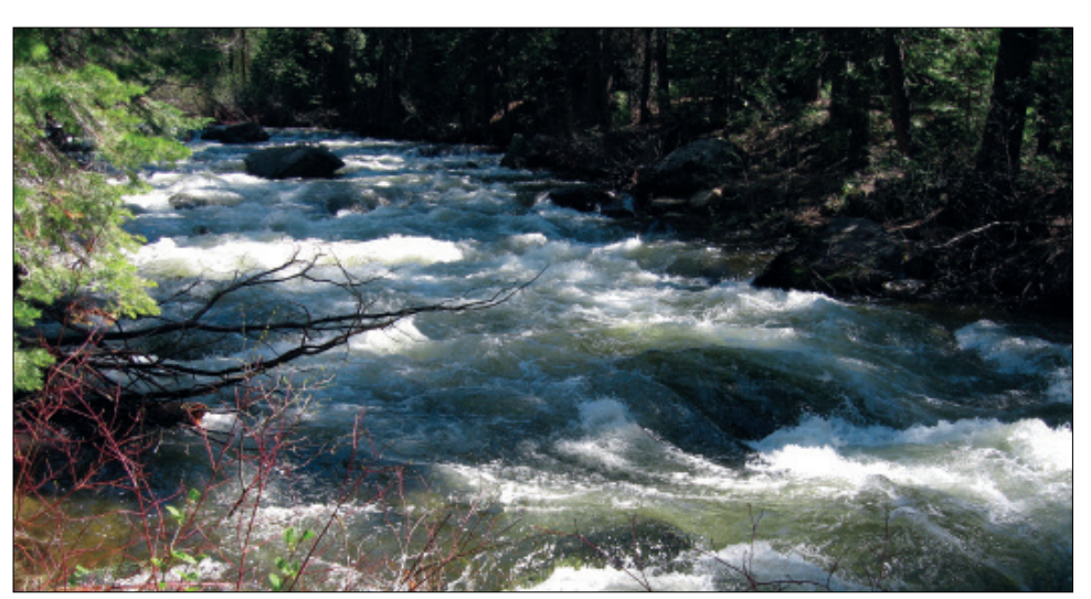
Water for the Strawberry service area is diverted from the upper South Fork American River

The information provided in this report is required by law to be issued to every water user. Property owners: please share this information with your tenants.