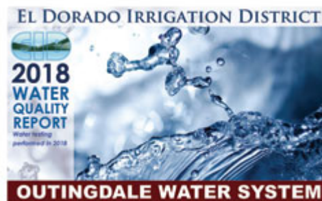
Outingdale System Report