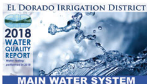
Main System Report

EID has rights to approximately 75,000 acre-feet of water from various sources in the Sierra Nevada foothills. (An acre-foot equals one acre of land covered by a foot of water; there are 325,851 gallons in an acre-foot.) Jenkinson Lake, at the center of Sly Park Recreation Area, provides nearly one half of our Main System's water supply. Forebay Reservoir in Pollock Pines delivers water under a pre-1914 water right from the high-alpine streams and lakes that are part of our Project 184 hydropower system. We have a water contract with the Bureau of Reclamation at Folsom Lake, which Reclamation operates as part of the state's Central Valley Water Project. And we hold ditch water rights (Weber, Slab, and Hangtown creeks), water rights at Weber Reservoir, and a water right under Permit 21112 for Project 184 water—all of which is delivered from Folsom Lake.