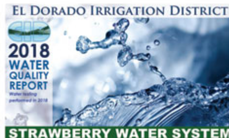
Strawberry System Report