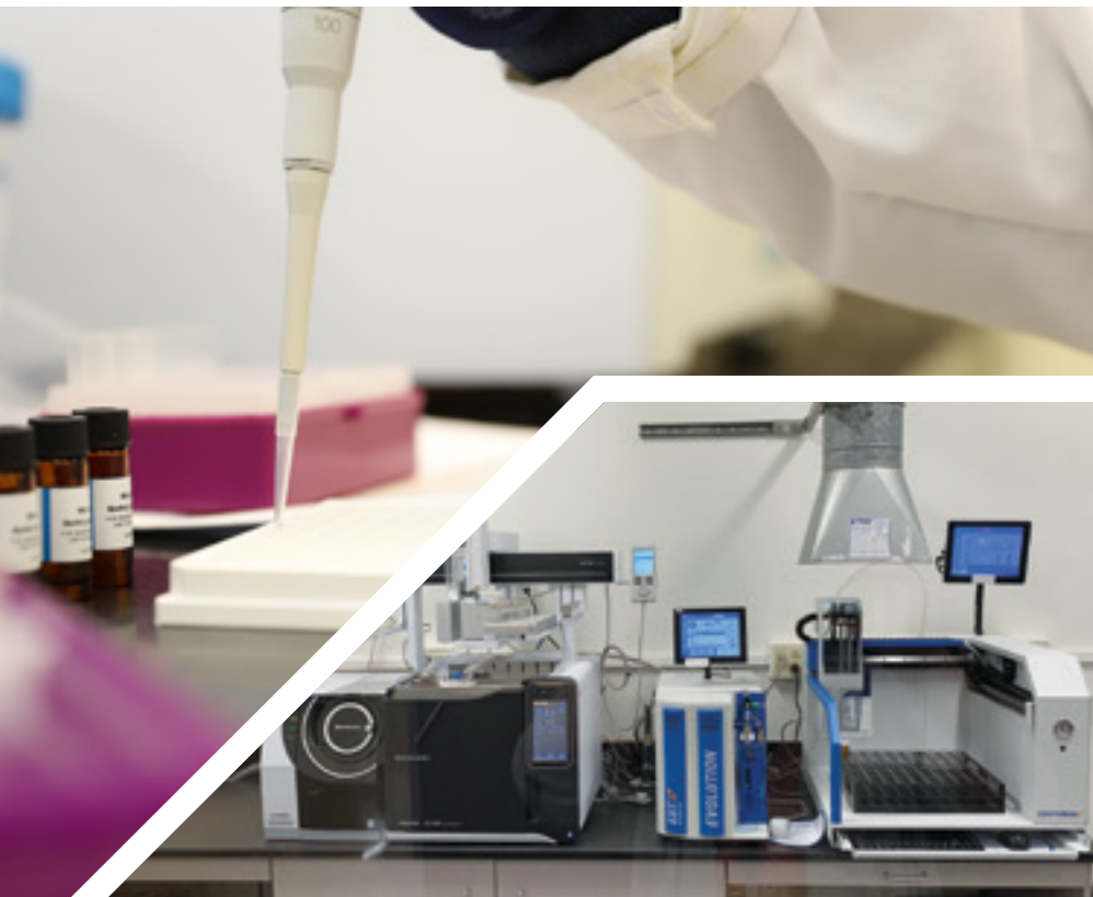
Your drinking water is continually sampled and analyzed. We perform tens of thousands of tests throughout the year to ensure your water is clean and safe to use.

None of the public water systems listed in this report produce or distribute bottled water. The State Division of Drinking Water mandates that the statements about bottled water be included in this report.