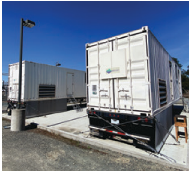
Backup generators would keep our water treatment plants running during an emergency.

We expect Public Safety Power Shutoffs to emerge again in 2020 and beyond. Get preparedness tips at ccwater.com/1040/ .