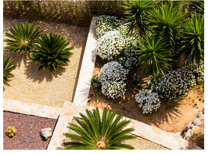
A drought-tolerant garden.

Customers interested in learning more about current and completed infrastructure projects in their service areas are encouraged to visit their service area's webpage at www.gswater.com.